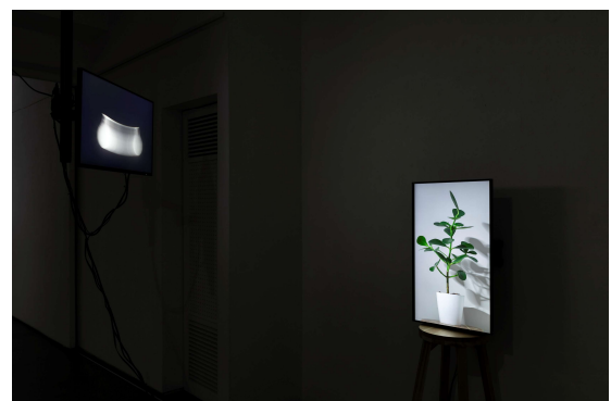
5. on Display (Paint) , 2023