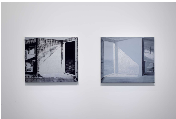
2. room of sky #1 , 2023

Recent award: “The 4th CAF Awards,” Special Jury Prize, 2017.