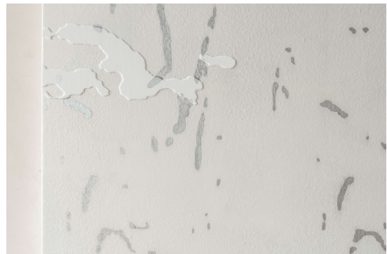
1. right landscape (the dog is scared of thunder) , 2023