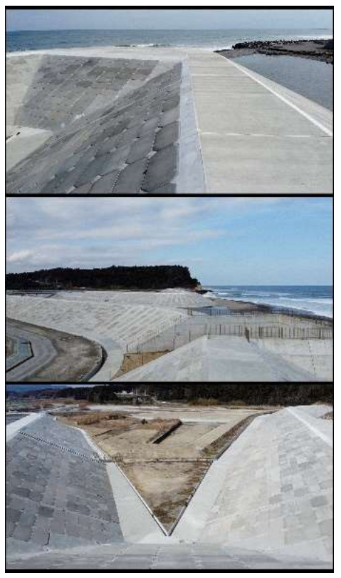
2. Vertige: 10 new walls of Tohoku, 2020, Vertical single channel 4K video

[Profile] Born in 1976 in Repentigny, Canada. Lives and works in Montreal. Graduated with an MA in Latin American Studies and Graduate Certificate in Peace and Conflict Resolution Studies, UC Berkeley, 2004. Recent exhibitions: "Péninsule," Rimouski Museum, Rimouski, Canada, 2023, "Incipit Covid-19," McCord Museum, Montreal, 2022-23, "Vertige: 10 news walls of Tohoku," Pierre-François Ouellette art contemporain, Montreal, 2022.