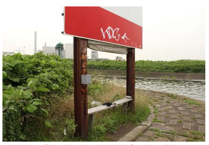
4. Arakawa River - Higashisumida, 2019, Sound installation

In this exhibition they present Sounding the City, an ongoing project initiated in 2015. This project involves recording sounds emanating from specific locations and their surrounding environments. The sounds are then reproduced through installations that focus our