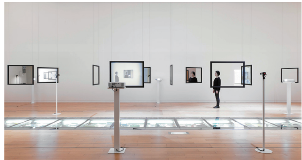
8. You would come back there to see me again the following day. , 2016, installation view at "Open Space 2016: Media Conscious," NTT InterCommunication Center [ICC], Tokyo

An Interview with the award winner, recorded in July 2022, is currently viewable on the TCAA website. ►