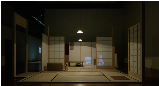
5. Tokyo Shigusa , 2021/2023, installation view at "ICC Annual 2023: Shapes of Things," NTT InterCommunication Center [ICC], Tokyo

This exhibition is analogous to seeing a poster peeling off the wall and gently sticking it back on, something that you might not need to do, but it's an extension of your instinct to act on the things you perceive.