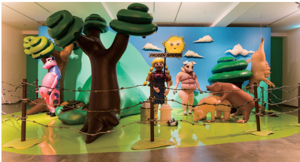
1 "Ultra Unreal" installation view at Museum of Contemporary Art Australia, Sydney, 2022

Let's all become animals to oink, moo, bleat, and cock-a-doodle-doo together!