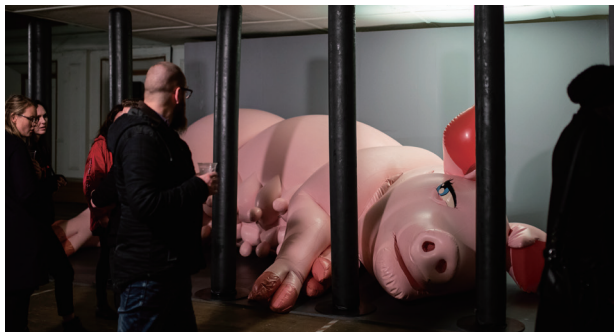
3 "Pigpen" performance at Dark Mofu 2019, Avalon Theatre, Hobart, Australia