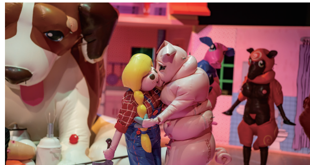
4 "Cycle of L" performance at The Museum of Art, Kochi, 2020

An Interview with the award winner, recorded in July 2022, is currently viewable on the TCAA website. ►