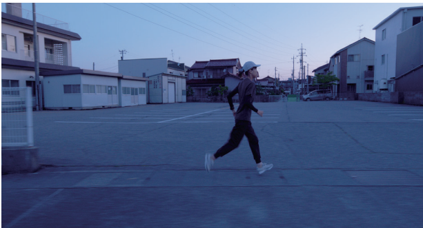
7. Still from so far, not far , 2023