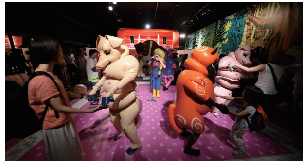
2 "House of L" performance at Aichi Triennale 2019: Taming Y/Our Passion, Aichi Prefectural Art Theatre, Nagoya