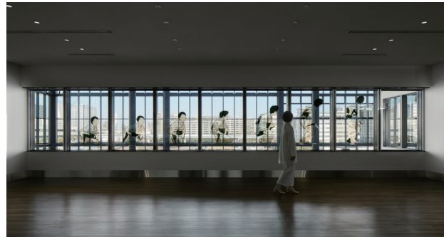
6. Tokyo Behavior , 2021, installation view at "Back TOKYO Forth," Tokyo International Cruise Terminal, 2021