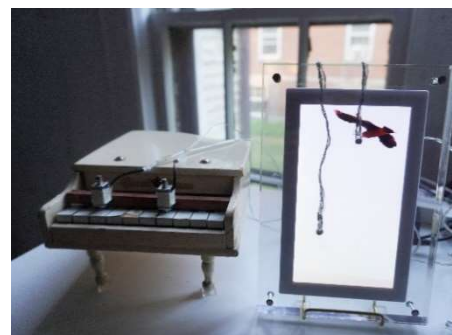
6. Birds without Borders Harvestworks, Governors Island, New York, 2023

Inspired by her experiences and research conducted during stays in five countries between late 2022 and early 2023, the artist examines the freedom of movement in the post-COVID age. Based on a quarantine island in New York Bay, ghost stories related to Japanese shrines in Taiwanese Taoism, and the trajectories of migratory birds in different countries, the work evokes invisible things while converting classical means of communication.