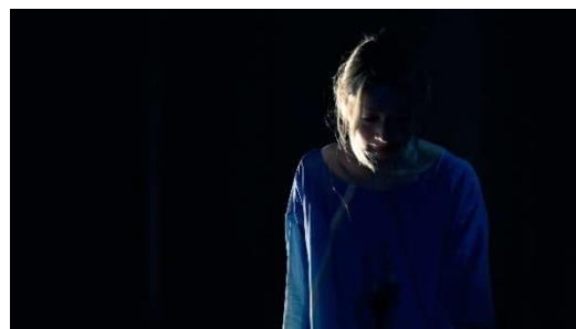
7. Well Temperament 2021