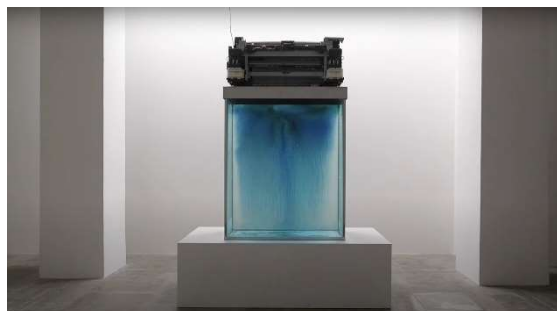
5. Soul Reclaim Device (“A portrait of my departed sister”) 2018

At some point in the future, data of humans during their lifetime are endlessly recycled by way of AI, so that the data remain alive even after people’s death. They are increasingly unable to remember things that we have forgotten, or that have fallen into oblivion. While standing up the memories sculpturally engraved in the photographs and expressing lost memories as material bodies, the work blurs the boundary between memories and records, to discuss matters and forms of existence, memory and death in the present age.