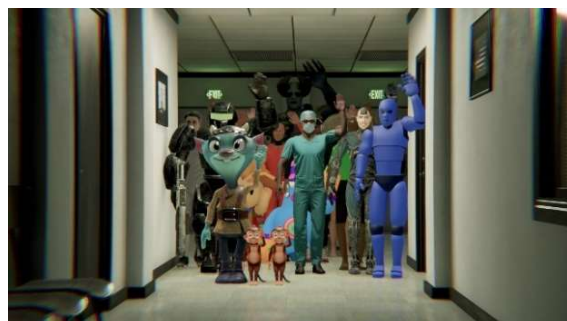
1. Unknown Friends 2023

Tokyo University of the Arts Graduate School of Film and New Media