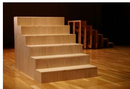
9. 6steps

The work “6steps” (comprising a six-step stairway, choreography and a stage set) is installed at the TOKAS Hongo building. Also exhibited are choreographic notes and instructions for performing “6steps,” to encourage visitors to work out their own dance up and down the stairs, based on their own interpretation. They may also find Kimura Reina, who conceived and choreographed “6steps,” dancing at the venue, either alone or together with someone else. The work can thus be enjoyed as an immediate experience, or observed at a distance.