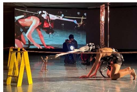
8. A Garden of Prosthesis EASTEAST_TOKYO, 2023

This performance inverts the anthropocentric concept of the world, in order to explore possibilities of the human body for the benefit of something else. Various artificial objects, natural objects and human bodies, which initially coexist on equal terms in this “garden,” are “grafted” by the “gardeners,” and eventually intrude one another. Each of these objects treats those around it as artificial limbs, and even humans end up being “prostheses” of plants or machines. As the relationships between the objects get increasingly out of control, they coalesce into chimeras that may deviate from the functions and meanings that have been defined within human society. While mutually contradicting, they arrange with each other in order to continue to coexist and shape the “garden.”