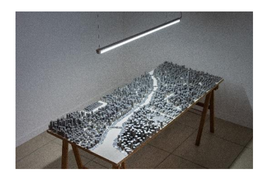
6. Imagined Earthquake 01: One Yen City (Seismograph) One yen coins, 75cm x 175cm table 2022

This year marks the 100th anniversary of the Great Kanto Earthquake that struck the Tokyo region in 1923, and the artist duo Zakkubalan drew inspiration from namazu-e (prints depicting a gigantic catfish believed to cause earthquakes) and disaster preparedness drills to create works that engage with our collective image of earthquakes. In this exhibition, they will present a sculpture of an imagined city that expands during the exhibition, made with a quantity of one-yen coins equal to the number of days that have passed since the Great Kanto Earthquake, as well as a video documenting people playing a card game that simulates the operations of an evacuation center.