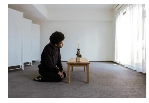
2. Candlestick Man Performance 2023

Coburn works with counterfactuals, or alternate histories. For Candlestick Man (2023), he looks at Japanese portrayals of the first Europeans to arrive in the country, with a particular focus on historical and speculative relationships between human migration and disease. This project takes form as an installation and performance, including wall sculptures made with gofun (a white medium made of oyster shells) and Oribe Nanbanjin candlesticks that depict Europeans.