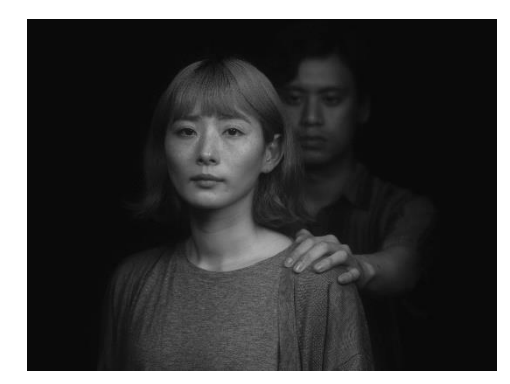
11. no sticks and stones can ever break our bones Video 2023

Stefański observes his own behavioral patterns in interpersonal relationships and analyzes them through film. Addressing the home as social environment and architectural space, he will present the first part of a moving image triptych investigation power structures in relationship. It has been shot in a traditional Japanese house that reflects the pattern of dynamics replayed in a relationship between protagonists.