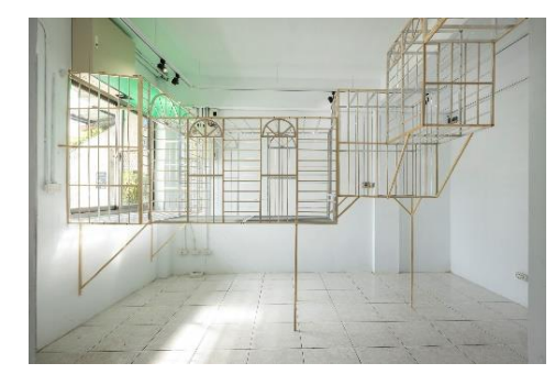
10. Inland Outside Wood, aluminum tape, window etc. 2022

Ohta's works explore the ambiguity of boundaries by inverting the interiors and exteriors of architectural spaces, or causing them to coexist. This exhibition features his work dealing with the elaborate window grills called tiěchuānghuā (lit. "iron window flowers") that are common in Taiwan. Through an installation incorporating the spaces outside these window grills, which are extensions of indoor spaces, he challenges viewers' conceptions of interior and exterior and the boundaries that separate them.