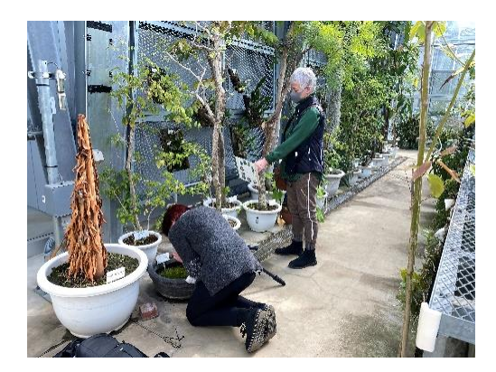
9. Research during TOKAS Residency Program 2023

Dealing with the imbalances in art, technology and societal issues through media art, the artist duo LarbitsSisters observed various forms of life around street gardens adorning Tokyo's residential areas. For this exhibition, they will present experimental work featuring a flowerpot that photosynthesis crafted out of an uncanny symbiosis between a man-made terracotta flowerpot and cyanobacteria, the oldest inhabitants of Earth's ecosystems. This in a reflection on their research they conducted during their residency in Tokyo on plant life in urban environments as a critical concern within the climate debate for urban regeneration.