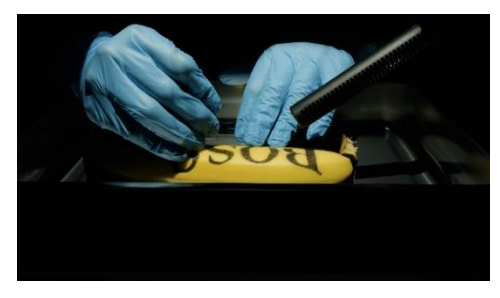
5. Tes content d'avoir passé une journée avec moi? #2 (Are you happy to have spent a day with me? #2) Triple channel video 2023

Inspired by his interactions with a young Moroccan immigrant during his residency in Brussels, Watanabe focused on the model of masculinity sought by this young man inhabiting a zone between traditional and globalized value systems. He will present a video installation series exploring complex intersections of identities among those who migrate to cities across national borders and into different cultural areas, juxtaposing this material with images of fruits from various places of origin brought together in urban spaces.