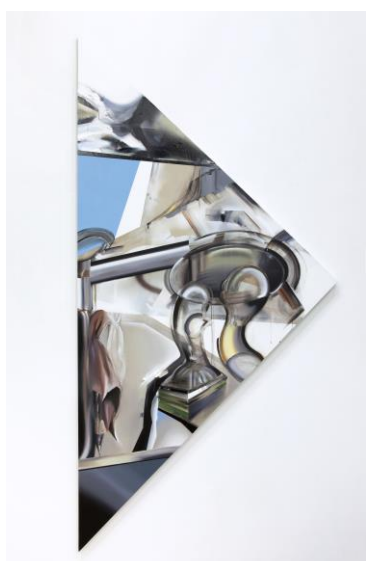
«Yobitsugi (memento/blue)» 2022 Oil and Acrylic on canvas, Panel