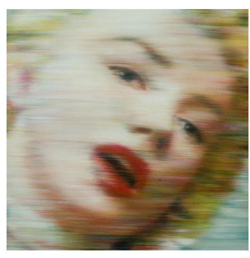
《Rose#01》 2009 Oil on canvas From "NOISE" Series

Awards: "GEISAI#10," GIANT ROBOT Award, 2010, "Epson Color Imaging Contest," Special Award, 2006.