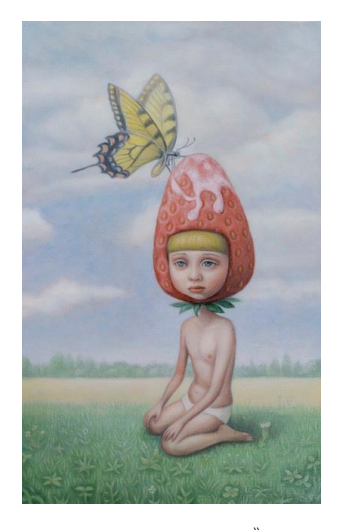
《Macaulay Culkin_judgement》 2017 Oil on canvas From "Macaulay Culkin" Series