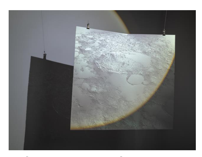
Moon(the Crater Daedalus) 2021 Paper (stardream-FS)

Recent exhibitions: "The stars that go around," SYP GALLERY, Tokyo, 2022, "Art Studio on a Star," Gallery Saikousha, studio study/Saikousha Institute of Art, Saitama, 2020, SUPER OPEN STUDIO "Nora no Tsukiatari," STUDIO ISSEI, Tokyo, 2019, "In My Room, Into SPACE," S.Y.P Art Space, Tokyo, 2018, "Suruganokuni Art Festival, FUJINOYAMA BIENNALE 2016," Old Igarashi House, Shizuoka.