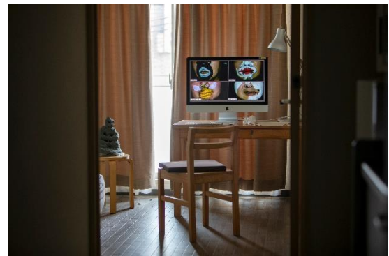
2. Meeting on MacArthur statue (online) , 2021 Video