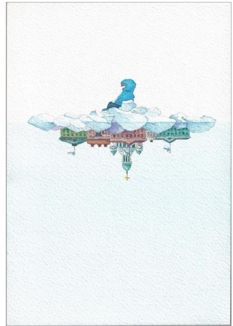
1. Pelagos [Helsinki Cathedral] , 2021 watercolor, color pencil, pencil on paper

【 Profile 】 Born in Chiba. Lives and works in Chiba. Graduated with an MFA from Tokyo University of the Arts in 2010. Major exhibitions: “RADIO DU VIVANT,” National Museum of Natural History, Jardin des plantes, Paris, 2022, “From Seeing to Acting,” Looiersgracht 60, Amsterdam, 2021, “Lands and the Beyond,” POLA MUSEUM ANNEX, Tokyo, 2021.