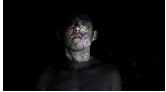
3. scape , 2022 4K video

Maetani, who works primarily with photography as a means of transforming and reflecting on his own actions, focused his research on rivers and waterways that flow through Tokyo, noting their presence as blank spaces in the city. In this exhibition, Maetani explores relationships between landscape and body through video and photographic works including self-portraits.