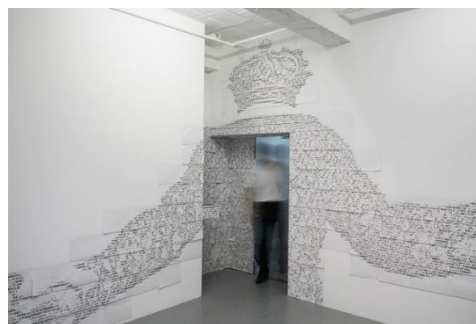
4. Document 1: Corona and Body , 2020 installation, laser print on papers