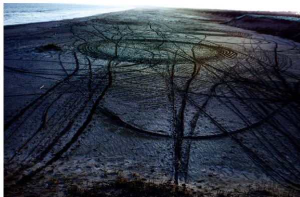
2. rasen kaigan 31 , 2019, C-type print at "RASEN KAIGAN," Sendai Mediatheque 6th floor gallery, 2012-2013