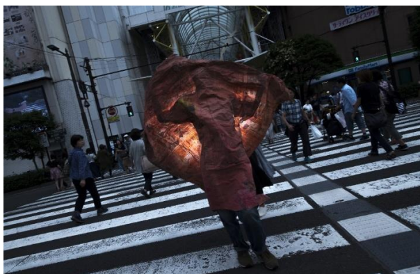
1. Today is the same as yesterday; tomorrow will be the same as today , 2019, C-type print at "Human Spring," Tokyo Photographic Art Museum, 2019

Awards: "The 33rd Kimura Ihei Award," 2007, "ICP Infinity Award," 2009.