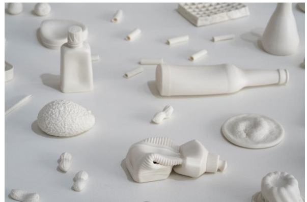
2. Still life Porcelain Ongoing series since 2013

For Still life , the installation they present in this exhibition, the artists made molds of various fruits, vegetables, light bulbs, cups and other daily commodities one by one, and used a special kind of porcelain compound that causes deformations of the sculpted objects during the firing process. By arranging countless objects in accordance with the venue's spatial properties, Hirose and Nagatani transform the entire space of their exhibition, to explore how we normally perceive the world.