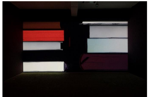
3. the towers (lights are books) Animation 2019-2020

For this exhibition, he focused on the route from his home to his atelier, as a time and space different from the "normal" that he became aware of as a result of the various restrictions imposed on him by the novel coronavirus. Here, the 35 minutes that the trip normally takes can be seen as a special kind of element that conjoins the "normal" environments of the artist's private life and creative work, which are usually not connected. On display here is a double screen animation piece based on a number of previously made items that are installed in one corner of the artist's atelier.